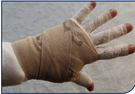
20. The individual length should be able to complete two rotations around the hand.