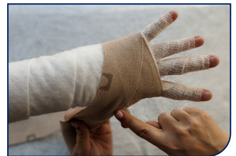
18. Once the hand has been encompassed, continue up to the wrist.