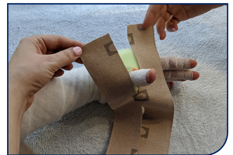
15. Drape over the hand. Apply the first "strap" over the dorsum of the hand.