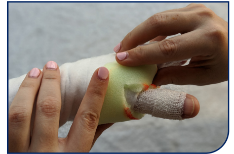
12. Apply foam as an option to ensure protection of the thumb web space.