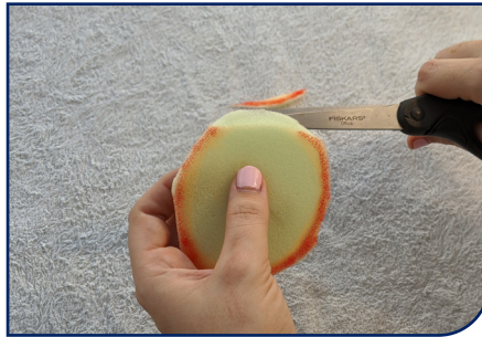
Foam Trim edges