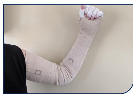
27. Test function and comfort and provide safety warnings.