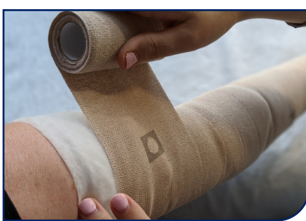
26. Finish two fingers from the axillary fold