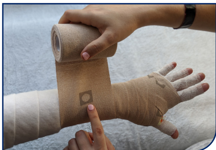
22. To achieve correct pressure, pull from oval to square on the pressure indicator.