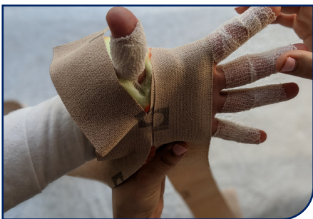
16. Drape and apply the more distal strap first, followed by the more proximal strap second.