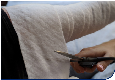
10. Trim excess.