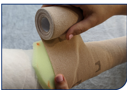
25. Optional Elbow pad - is recommended especially for the first application.