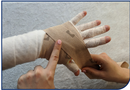
19. Apply a second layer to ensure optimal stiffness is created over the dorsum of the hand.