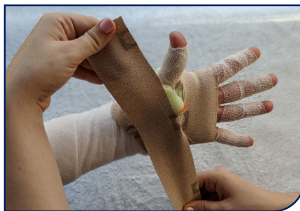
17. Use the second strap over the dorsum and the thenar eminence area. Wrap in a figure 8 pattern to encompass the base of the thumb.