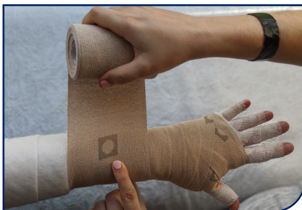
23. Maintain the correct tension during application to ensure even compression.