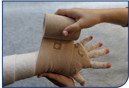
Compression layer arm Overlap hand compression with a loose anchor. Compress up the limb.