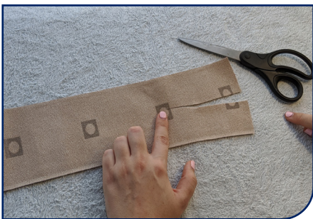
Compression layer hand Cut a piece of the compression layer that is approximately 8 squares long. Cut to one square from one end.