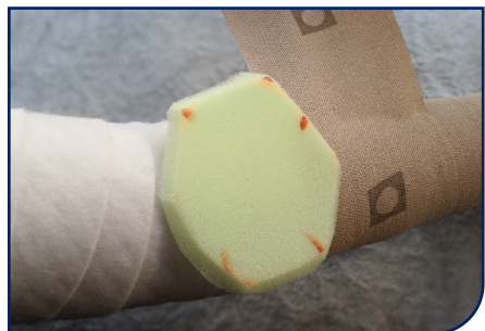
24. Elbow pad- is optional